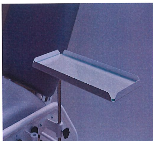
Chair table 25x35 cm; load 10 kg